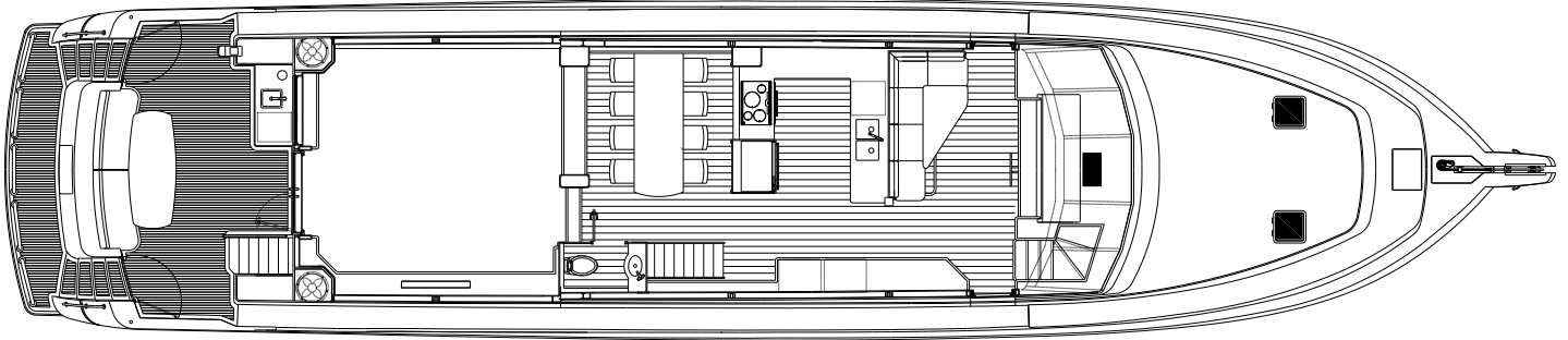
MAIN DECK PLAN